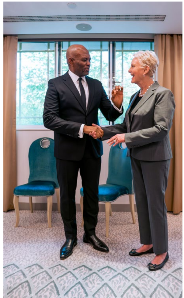
Tony O. Elumelu, CFR, Founder, The Tony Elumelu Foundation; and Cindy McCain, Executive Director, World Food Programme.